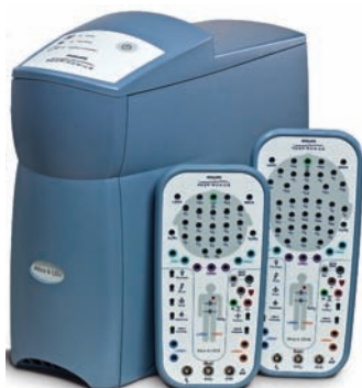
Alice LDx system with LDxS and LDxN head box.

Sleepware G3 features an exclusive composite channel type, useful when titrating complex sleep apnea patients with the BiPAP autoSV Advanced. The channel integrates the various parameters available from the BiPAP autoSV so a clinician can see the relationships of the various parameters on a breath-to-breath basis. Additionally, this composite channel allows the clinician to eliminate the redundant channels from view, which provides them with better screen visibility to all of the data.