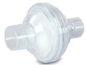
Bacterial filter (342077 10/pack)