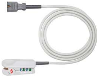
Re-usable ped finger clip SpO 2 sensor (Masimo) (1072878)