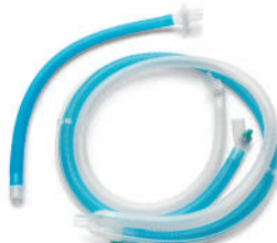
(15mm 1127304)* (22mm 1127303)*