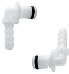
Oxygen inlet adapter (1040390)