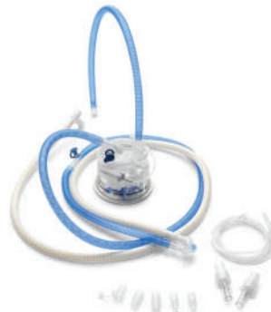
RT265 Fisher & Paykel infant dual limb (1141548)