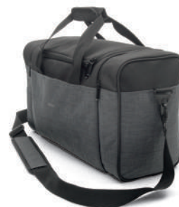
Trilogy Evo travel bag (1134428)