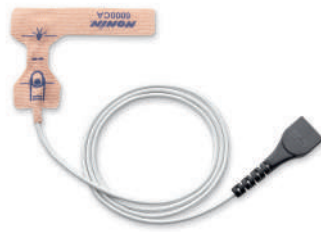
Pulse oximeter sensor, adult (1070692), pediatric (1070693), infant (1070694)