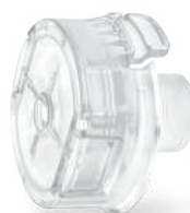
Dual limb AEV (1139436 10/pack) (1132110 1/pack)