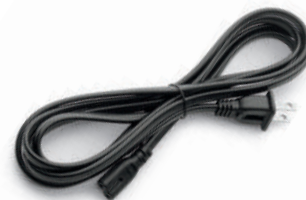
Power cord, straight C7 end - 8ft