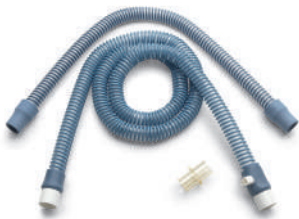
Fisher & Paykel 900MR810 reusable circuit (1141549)