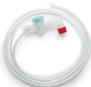
Disposable active exhalation valve (1131661 10/pack)