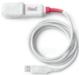
External pulse oximeter (Masimo USB cable) (1145408)