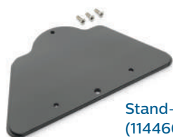
Stand-alone mounting plate (1144668)