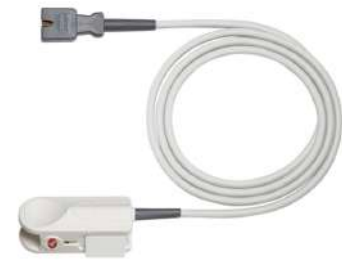
Re-usable adult finger clip SpO 2 sensor (Masimo) (1081984)