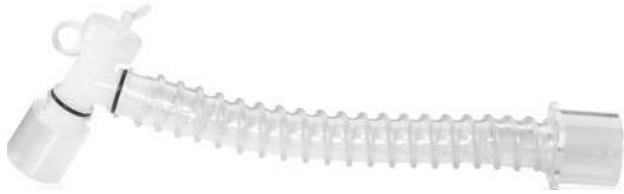
Flexible trach adapter with 22 mm connection (1073902/pack) Connects to exhalation ports used with the passive circuit.