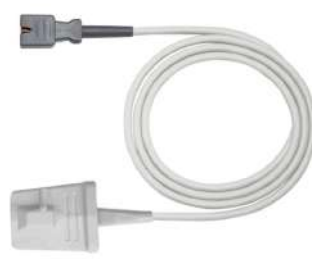
Re-usable adult soft SpO 2 sensor (Masimo) (1081516)