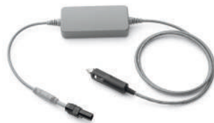
Cable, 12/24V battery with car adaptor (1127402)