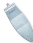
Test lung (1021671)