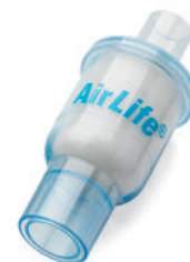
Airlife, adult (C06274)