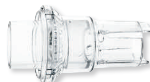
Whisper swivel II (332113)