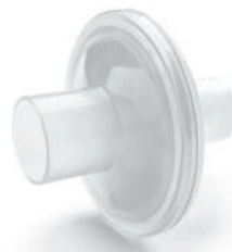
Bacterial/viral filter (1147018 10/pack)