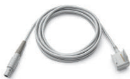
Electronic flow sensor cable (1134592)