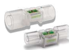
Disposable electronic flow sensor, adult and infant (1146497) (1146558)