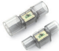
Electronic flow sensor, adult and infant (1134711) (1134712)