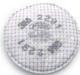
Particulate filter (1134430 10/pack)