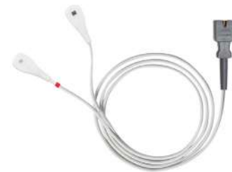
Re-usable multisite SpO 2 sensor (Masimo) (1081985)