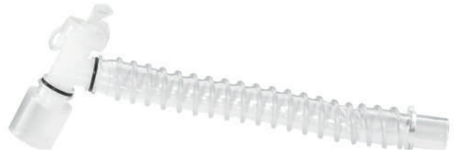
Flexible trach adapter with 15 mm connection (1073863 10/pack) Connects to the flow sensor of the active exhalation valve.