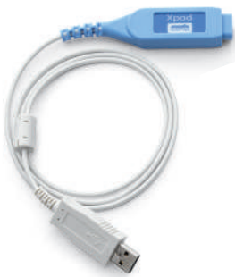
External pulse oximeter (Nonin XPOD - USB cable) (1129640)