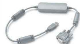
Cable, isolated, USB to DB9 (1127405)