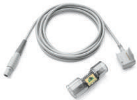
Electronic flow sensor accessory with cable, adult/ped (1132106 )