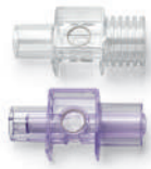
Capnostat airway adaptor (6312-00) (6063-00)