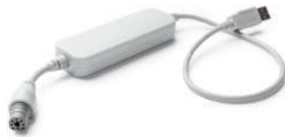
Capnostat USB adaptor (1127404)