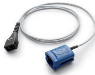
Re-usable adult SpO 2 sensor (Nonin) - pediatric (936P), adult (936)