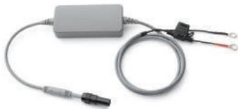
Cable, 12/24V battery with terminals (1127401)