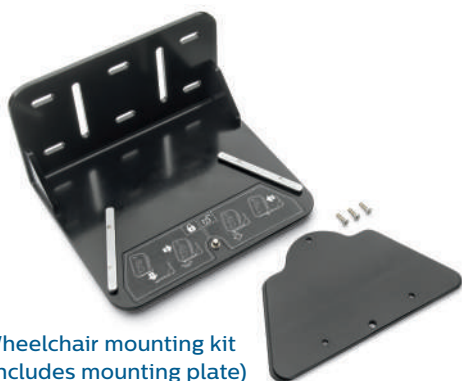
Wheelchair mounting kit (includes mounting plate) (1134633)