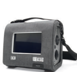
Trilogy Evo in-use case (1133930)