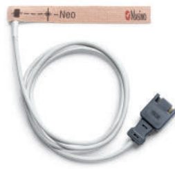
Pulse oximeter sensor, neonatal (1065306)