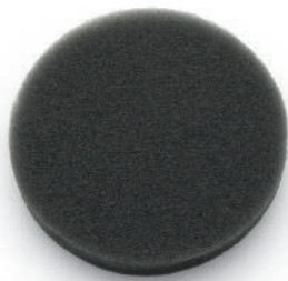
Air Inlet Foam Filter (1134591 10/pack)