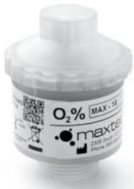
FiO 2 sensor assembly (1134668)