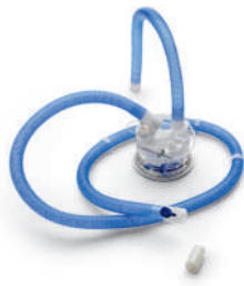
RT202 adult single limb heated circuit kit (1141426)