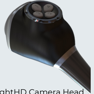
InsightHD Camera Head

The camera comes with a lightweight camera head equipped with 4 customizable buttons, designed to minimize fatigue during prolonged surgical procedures.